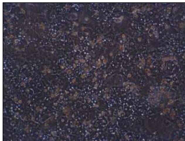
Photomicrograph (100x) of HC2-39 incubation day